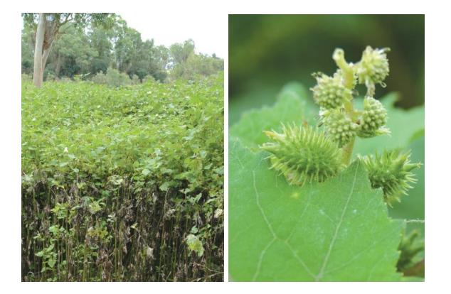
BATHURST BURR (Xanthium spinosum)

Noogoora Burr is not a declared weed in Queensland.