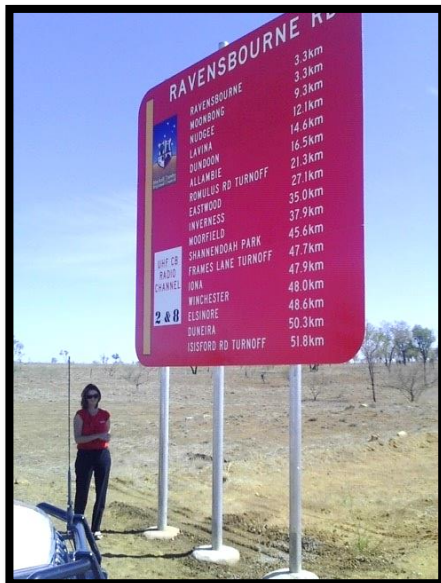
Emergency Services Sign for Ravensbourne Road